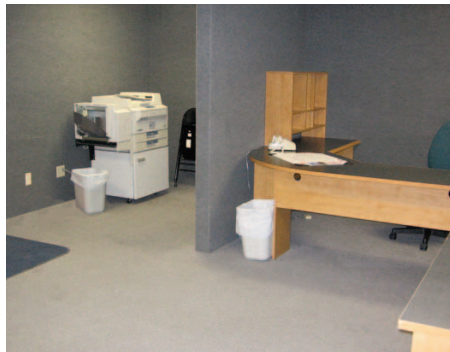
Front Office View 1