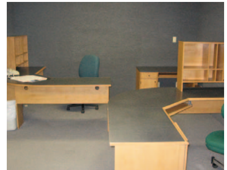
Front Office View 2